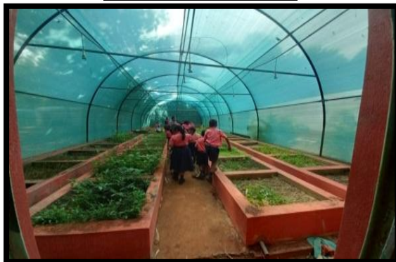
BIO-DIVERSITY BOTANICAL GARDEN